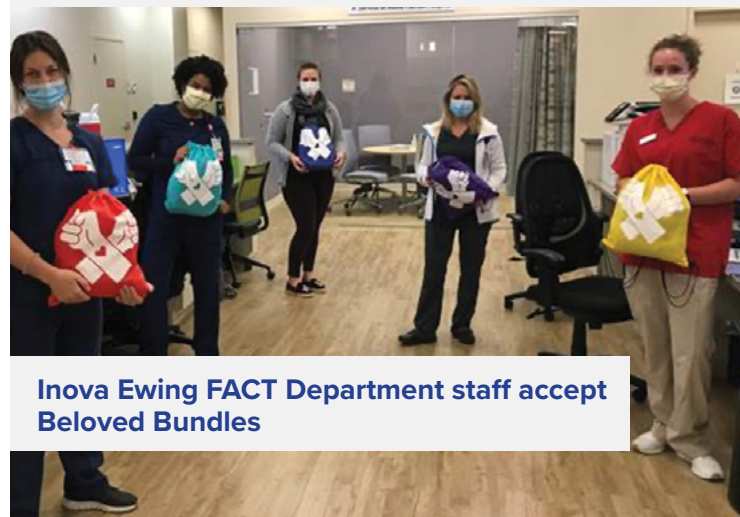
Inova Ewing FACT Department staff accept Beloved Bundles

National Center for Injury Prevention and Control, Centers for Disease Control and Prevention.